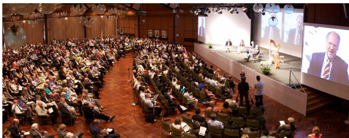
The opening ceremony of the 2010 Lindau Conference

Every year for the past 60 years, a host of recipients of the Nobel Prize have met on the isle of Lindau, situated on Lake Constance in south Germany. With this year marking the 60th anniversary of the first such event, a special interdisciplinary meeting was held bringing together 59 Nobel Laureates and over 650 students from diverse scientific backgrounds and every corner of the globe.